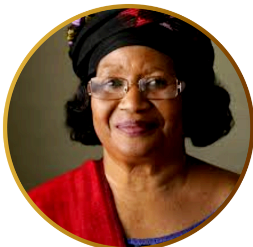
Her Excellency Joyce Banda